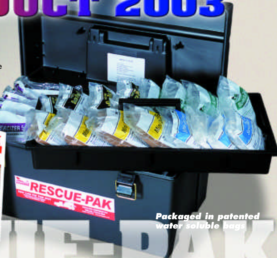
Packaged in patented water soluble bags